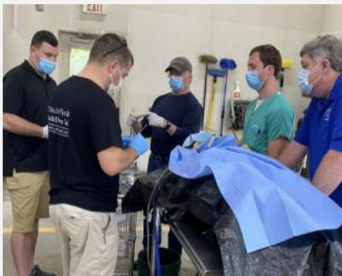
Critical Care Academy Tissue Lab in Damariscotta

Construction on the labs started in June with the creation of simulation control rooms and meeting spaces for reviewing recordings and the critique of patient care practices. Two high-fidelity patient simulators and the technology that controls them have also been installed. “Hal” and “Pediatric Hal” have become lifelike patients under the skillful control of a simulation educator. In the coming months, the audio/video recording platform and patient care equipment will also be completed. An official grand opening for the simulation labs is tentatively planned for December 2021.