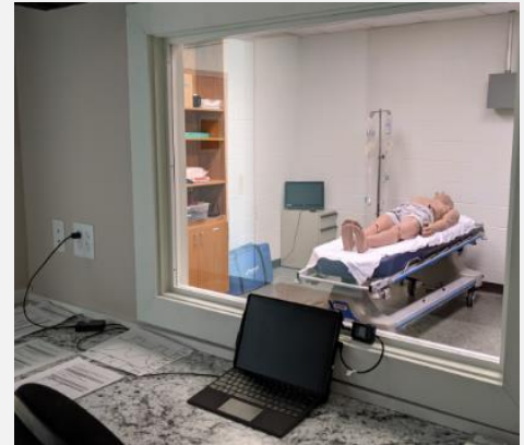
Bangor Savings Bank Foundation Simulation Lab.

In June, LifeFlight secured a generous gift from the Bangor Savings Bank Foundation to create simulation labs at each of the three bases in Bangor, Lewiston, and Sanford. Simulation is essential to LifeFlight’s training and education work, and now all three locations will be virtually connected to provide advanced critical care training with “real” patients for LifeFlight staff, community hospital staff, and EMS providers across the state of Maine. In addition to providing 24-hour access for clinicians, each lab will also host a remote learning platform, which is particularly useful for LifeFlight Academy education programs. Lead instructors will present programs from one site, with smaller groups of trainees practicing at each remote site/education lab.