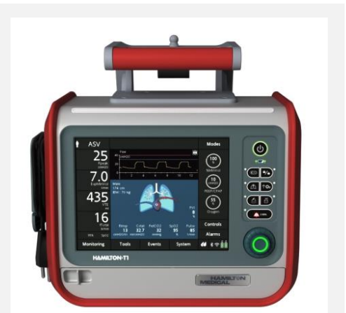
Hamilton T-1 ventilators are being installed and provide improved care to COVID-19 patients.