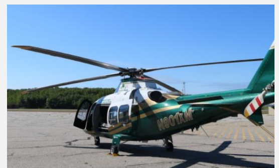
XM at the LifeFlight Lewiston Base.

LifeFlight is aggressively seeking support that will allow us to take delivery of the third, upgraded aircraft in 2022.