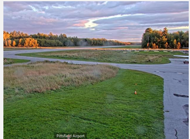
Runway camera image at Pittsfield Municipal Airport.